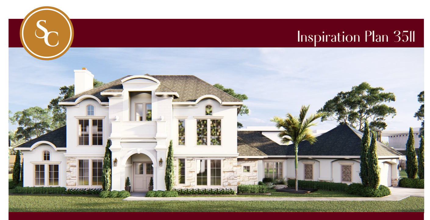
4 BEDS | 3.5 BATHS | 3,511 SQ FT. | 2 CAR GARAGE